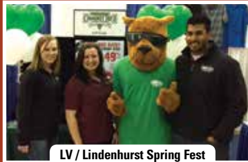
LV / Lindenhurst Spring Fest