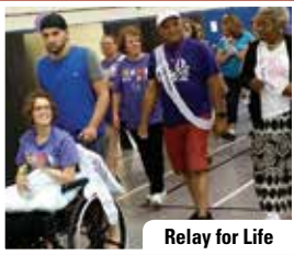
Relay for Life