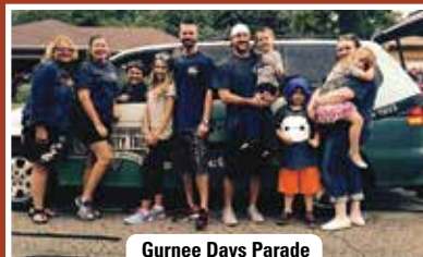
Gurnee Days Parade