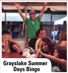
Grayslake Summer Days Bingo