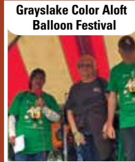
Grayslake Color Aloft Balloon Festival