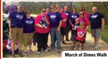
March of Dimes Walk