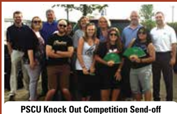
PSCU Knock Out Competition Send-off