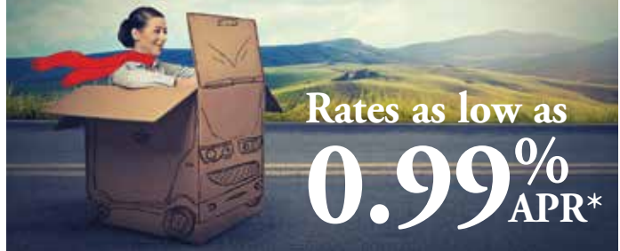
*APR=Annual Percentage Rate. Rate is based on the term of the loan, credit worthiness of borrower and qualifying services. Must meet credit union guidelines. Rates subject to change without notice. Not all loans will qualify for advertised rate. Offer available on new and used auto and motorcycle loans (model year 2011 or newer to qualify for special rate). Payment example: 0.99% APR for 24 months is $42.10 per $1,000 borrowed.